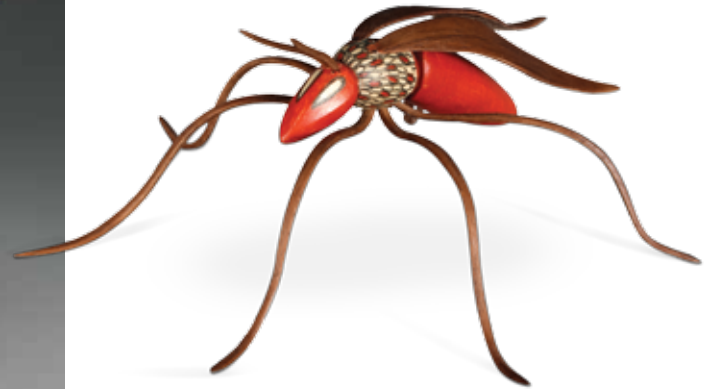
Tania Radda , Desert Dweller , 2012, Basswood, compressed walnut, pencils, 4" x 4" x 4" (10cm x 10cm x 10cm)

Tania Radda has pioneered the use of compressed wood in turned art pieces. For Last Flight and Desert Dweller , she used a bandsaw to cut the compressed wood into thin sheets or fine rods, then wetted and formed them into tendrils, leaves, legs, and wings. A hair dryer fixed them into permanent position.