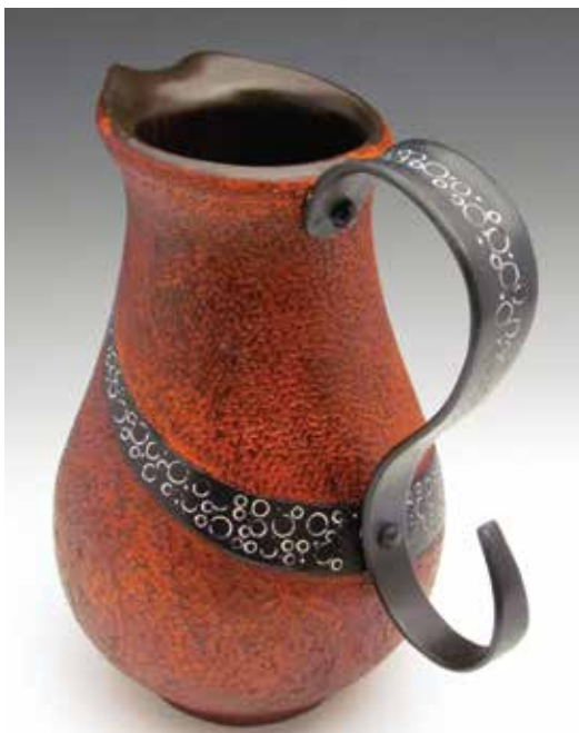
Pat Miller , Fill Me Glass, Wench! , 2013, Birch, compressed maple, ebony, 8" x 7½" x 5" (20cm x 19cm x 13cm)