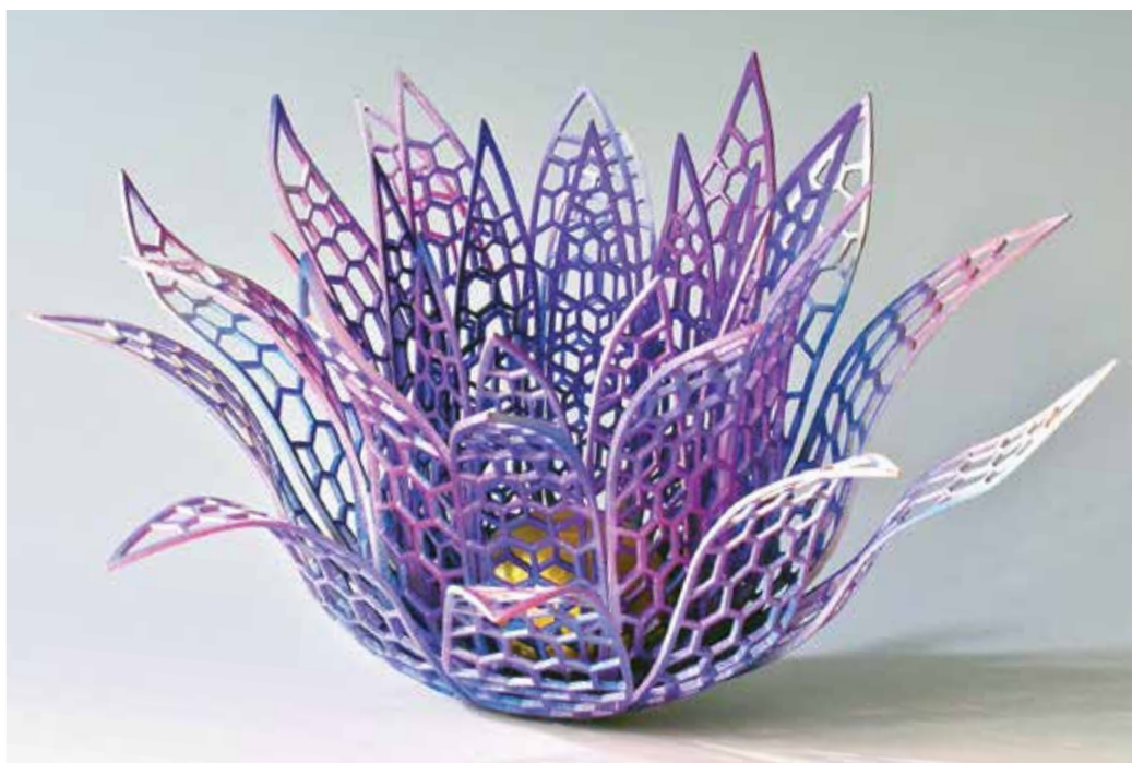
Malcolm Zander , Flower , 2010, Compressed cherry, gold leaf, acrylic paint, 6" × 8" (15cm × 20cm)