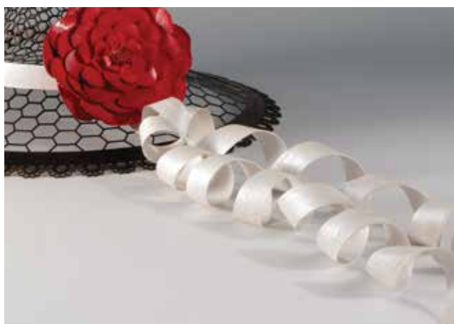
Malcolm Zander , ribbon detail from Black Lace Hat With Crimson Flower , 2012, Bigleaf maple, madrone burl, compressed cherry, acrylic paints, 8" × 27" × 15½" (20cm × 69cm × 39cm)