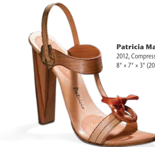
Patricia Matranga , Brazilian Rainbow , 2012, Compressed cherry, tulipwood, cork, 8" x 7" x 3" (20cm x 18cm x 8cm)