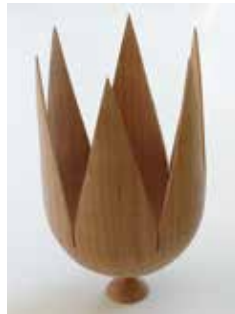
A turned parabolic form was cut to give six triangular leaves, which were individually bent, glued together, and then pierced.