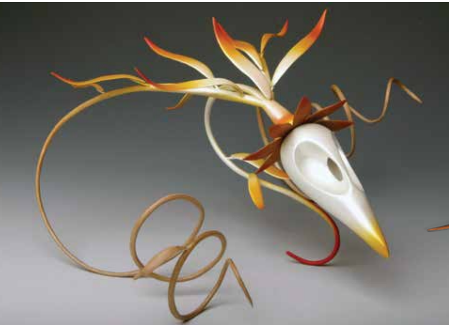
Tania Radda , Last Flight , 2005, Basswood, compressed maple, automotive paint, 11" x 16" x 15" (28cm x 41cm x 38cm)

Tania Radda has pioneered the use of compressed wood in turned art pieces. For Last Flight and Desert Dweller , she used a bandsaw to cut the compressed wood into thin sheets or fine rods, then wetted and formed them into tendrils, leaves, legs, and wings. A hair dryer fixed them into permanent position.