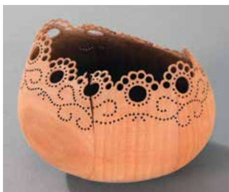
The author's experimental thin-walled endgrain bowl made from three laminated pieces of compressed cherry, then wetted and distorted to an oval shape. Note failure of glue joints due to use of non-waterproof glue.

diameter body (5", or 13cm), I would have to laminate several planks together (it was available only in 1½", or 38mm thicknesses). This does work, but I found out the hard way you had better use a waterproof glue, as seen in the adjacent photo.