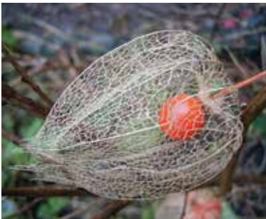
A Chinese Lantern ( Physalis alkekengi ), or cape gooseberry seedpod, was the author's inspiration for an intricate project requiring compressed wood.