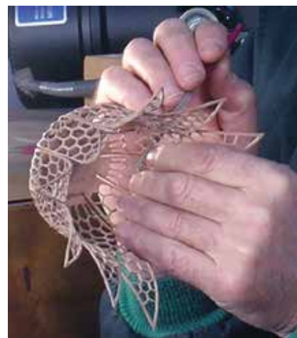
Flower involved turning an endgrain lamination of compressed cherry, piercing, filing, and painting.