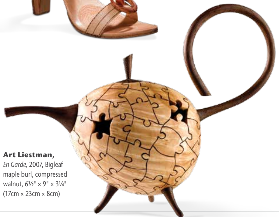
Art Liestman , En Garde , 2007, Bigleaf maple burl, compressed walnut, 6½" x 9" x 3¼" (17cm x 23cm x 8cm)